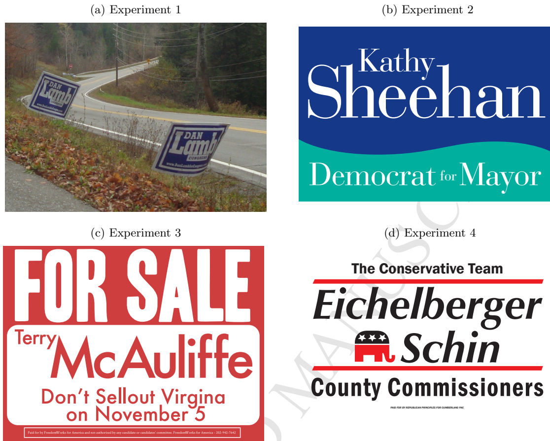
Figure 1: Signs

The lawn sign used in Experiment 1 was designed to be conventional in all respects. The size and shape were the standard 18 x 24 inch rectangle. The colors were white type on a blue background, which is a common format, especially for Democrats. The candidate's last name commanded the largest font. Somewhat smaller font was used for his first name and the word "Congress," which appeared in blue type on a white background. The bottom of the sign gave the candidate's campaign website. The sign contained no graphics or photos.